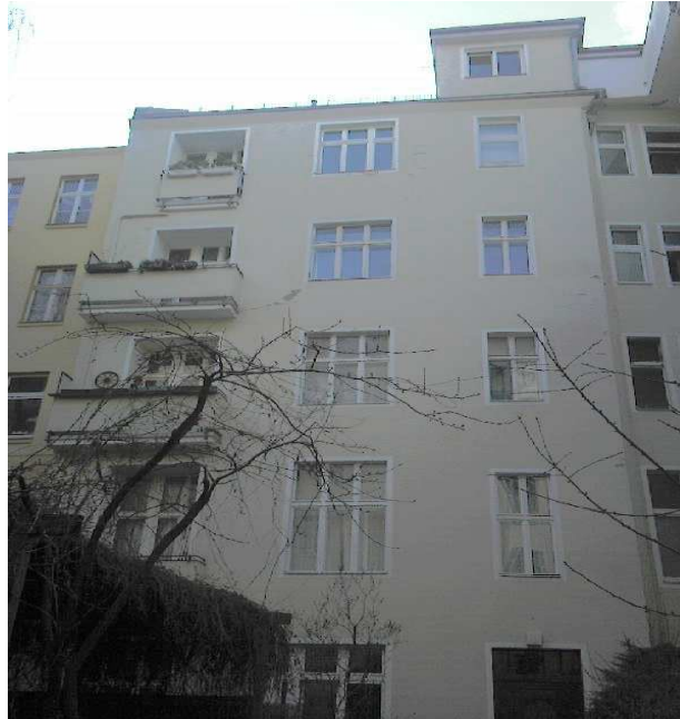
The Back House – Rear of Kaiser Friedrich Strasse