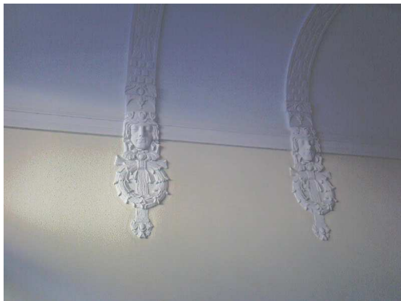
Original Features – Entrance Hall

Disclaimer: To the best of our knowledge all informations contained within this communication are accurate and have been procured with due diligence. BerlinBuy2Let and any party associated with BerlinBuy2Let with regard to this promotion are not liable for damages claimed as a result of any information(s) contained within this document and provided to clients or prospective clients.