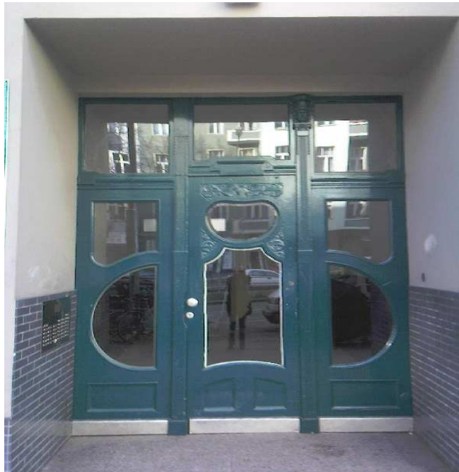
Entrance to Building

Disclaimer: To the best of our knowledge all informations contained within this communication are accurate and have been procured with due diligence. BerlinBuy2Let and any party associated with BerlinBuy2Let with regard to this promotion are not liable for damages claimed as a result of any information(s) contained within this document and provided to clients or prospective clients.