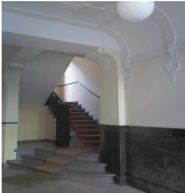
Main Entrance – Kaiser Friedrich Strasse