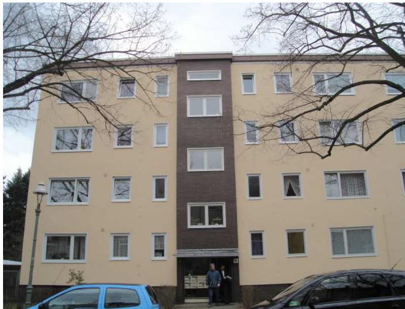
Front of House – Entrance

Object Information: 1 Roomed apartment. Free-hold flat floor space: approx.. 40,00 m 2