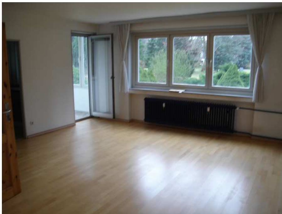
Living Area with door to enclosed Balcony

Disclaimer: To the best of our knowledge all informations contained within this communication are accurate and have been procured with due diligence. BerlinBuy2Let and any party associated with BerlinBuy2Let with regard to this promotion are not liable for damages claimed as a result of any information(s) contained within this document and provided to clients or prospective clients.